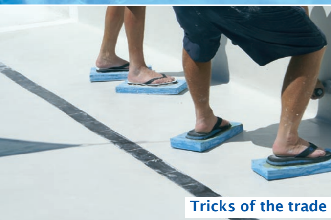
Tricks of the trade