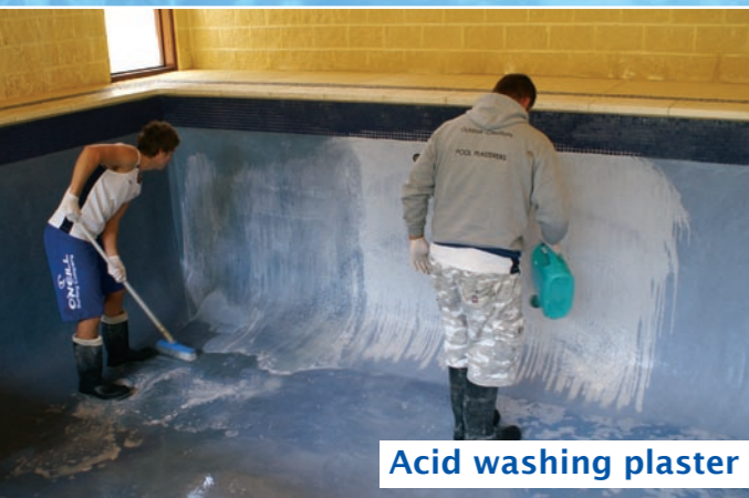
Acid washing plaster